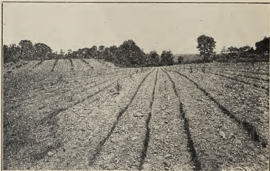
This shows two fields of our Young Orchards with 1 year Asparagus Plants consisting of about half million assorted varieties. Photographed July 10, 1924.

By Parcel Post add 15c per 100 plants extra.